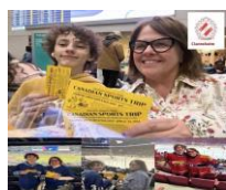
Claesholm Kinsmen Sports Raffle Winner